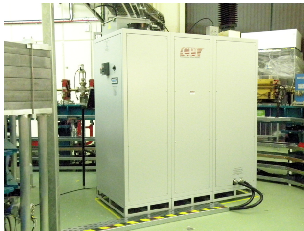
Figure 1: VIL409 high power RF amplifier installed at the Daresbury Laboratory

could be optimized for use in the EMMA accelerator. Therefore, the user has the ability to remotely set IOT Beam voltage within the range from -38 to -45 kV (with respect to Earth/ground) and the IOT grid bias voltage within the range from -85 to -130 V (with respect to the IOT's cathode potential). In addition to a straight forward DC grid bias voltage set, the user may also elect to pulse the grid.